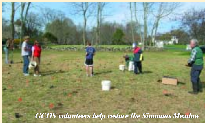
GCDS volunteers help restore the Simmons Meadow

Last spring, Greenwich Country Day School students helped GLT's stewardship crew restore a beautiful wildflower meadow on Mountainwood Road. They planted a variety of Butterfly Weed and Blazing Star to enhance existing butterfly habitat, which was predominantly Milkweed. In mid-August, a small group of GLT members returned to the meadow to check on the new plants (which seemed to be thriving in this open environment) and to remove invasive species along the meadow's border.