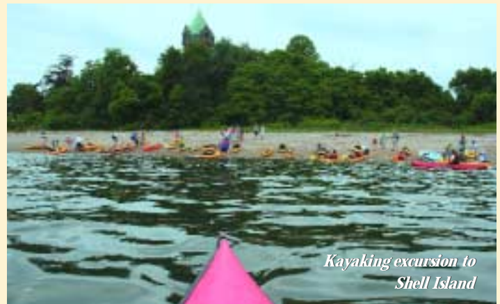
Kayaking excursion to Shell Island

With the help of architects, architectural historians, and roofing experts, the GLT is developing guidelines to preserve the historic stone tower on GLT's permanently protected 5.2-acre Shell Island. A final report in 2010 will help GLT's Board of Directors decide how best to proceed with preserving this historic landmark. This important project will require additional funding.